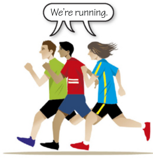
They're running . They aren't walking .