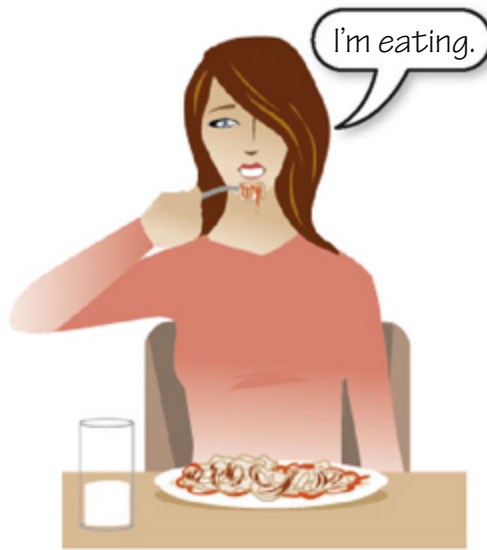
She's eating . She isn't reading .