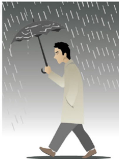
It's raining . The sun isn't shining .